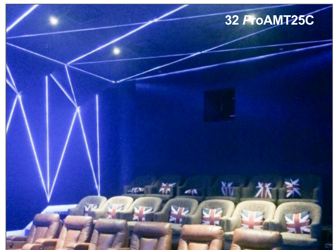
Zhong Le Video+Music demo home theater

Zhong Le Video+Music Co Shenzhen one of various demo home theaters equipped with 32 speaker units employing Mundorf ProAMT25C and 4 sub-woofers!