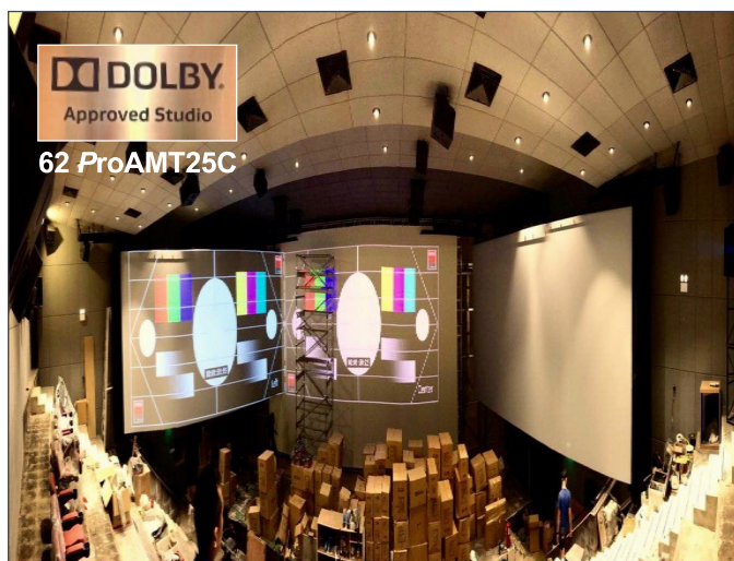
The newly opened Escape3D SUNBEAM movie theater in Hongkong