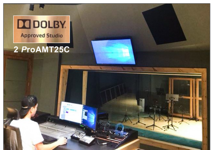
Rehearsal + Recording in Zhongshan Film University

©2018 MUNDORF EB GMBH Liebigstr. 110 50823 Cologne GERMANY mundorf.com info@mundorf.com