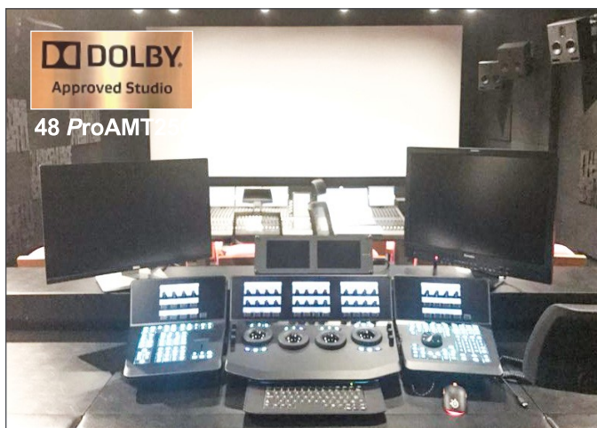
Shanghai Rui Chuang Commercial Rehearsal cinema and recording room

In July 2015, Hongkong MBS Studios asked their chief developer to develop a new monitor and film-theater loudspeaker series „from first scratch“! Then, the expressed requirement of MBS-Studios was to use AMT (Air Motion Transformer) tweeters. With this advice, the chief developer also got some brochures of different AMT manufacturers, including Mundorf's Pro-AMT brochure. Shortly thereafter, MBS-Studios' chief developer contacted Mundorf company for to discuss the special requirements and possible solutions for an AMT integration. After all, we mutually decided to try our Pro AMT25Cinema for the related projects and, after some minor changes, Mundorf Pro AMT25C model was fully approved by MBS Studios.